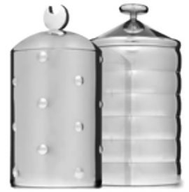
ALESSI KALISTO CANISTER

Designed by Clare Brass 1992 for Alessi. Polished stainless steel storage containers.