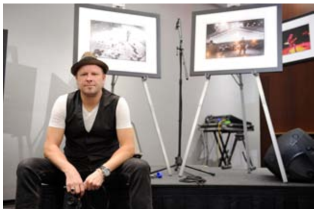
Danny Clinch exhibit at W South Beach

Uniting our passion points of music and design, legendary rock photographer Danny Clinch's award-winning shots adorn the walls of each guest room and corridor at W South Beach. Art met Rock at W South Beach as Citizen Cope performed live and filled the Studio with his soulful sounds. The famed lensman was on hand to grant guests an inside look behind the camera at some of his favorite subjects and newest snapshots. From Johnny Cash to Jay-Z, from Bjork to Bruce Springsteen, Danny's work displays an honest and powerful quality that simply can't be duplicated.