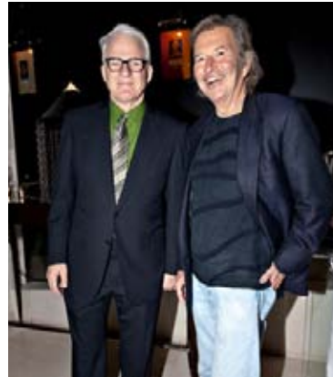
Steve Martin and Bob Shaye at Mr Chow

Intrinsically, party-hopping at Art Basel is a little tedious, but that doesn't stop anyone from doing it. For one, there are too many events, indistinguishable from each other except, perhaps, by the brand of champagne being uncorked. For two, there just aren't enough swells to fill the demand. You leave cocktails at the Webster; a chi-chi boutique selling Alaia on Collins Avenue, and go all the way downtown to the Rubell Collection, only to discover the fellows you left in the dust, wearing their slimly cut trousers and nerdy eyeglasses, walking in at the same time. On Wednesday,