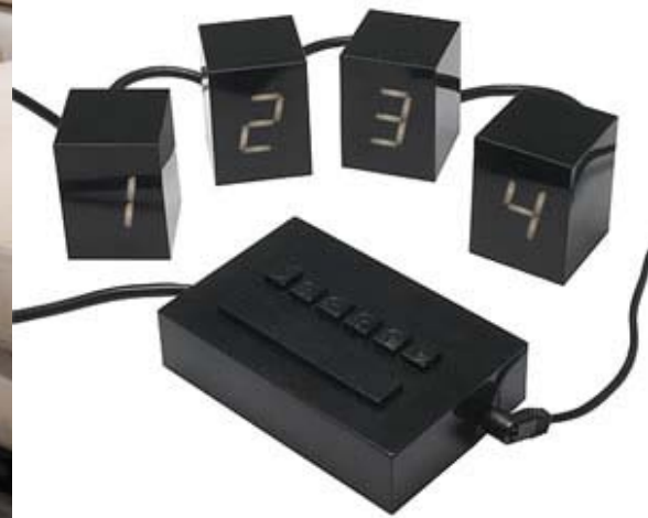
JONAS DAMON NUMBERS CLOCK

Bring Home a New Look for the New Year with W Hotels - The Store.