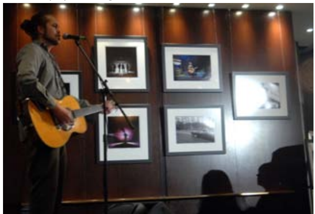
Citizen Cope performing at W South Beach